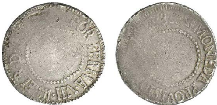
Real de Catorce 1811 8 Reales

A parting commentary on the Catorce issues: firstly, it should be noted that the various references to a Royalist Provisional mint being established at Real de Catorce 4 probably refer to the issue of copper ¼ Reales by Royalist commander Teodoro Parrodi in 1815 rather than the silver (and insurgent) 1811 8 Reales.