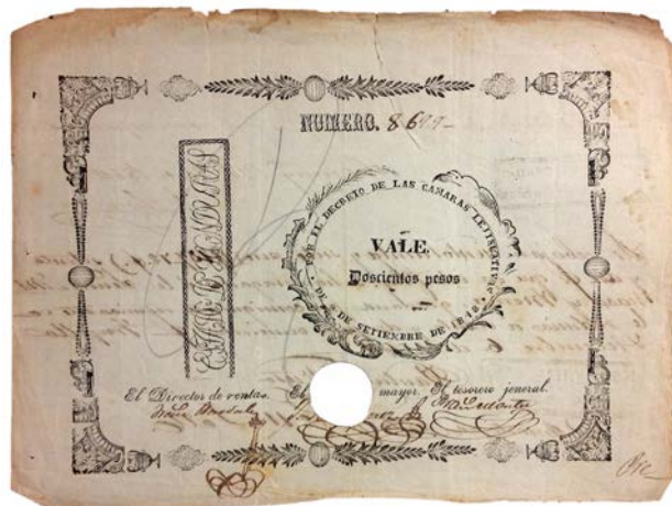
Honduras 200 Pesos Decree of 1848 (later type, P-Unl)