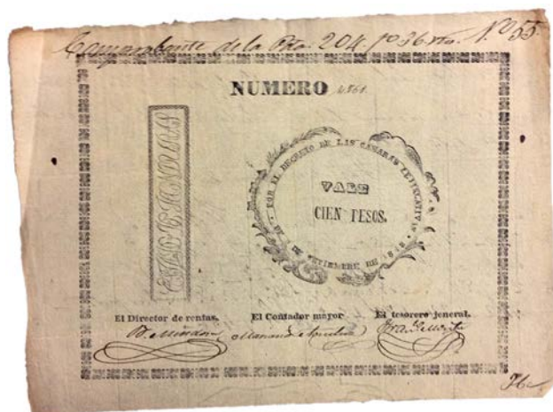
Honduras 100 Pesos Decree of 1848 (early type, P-6)