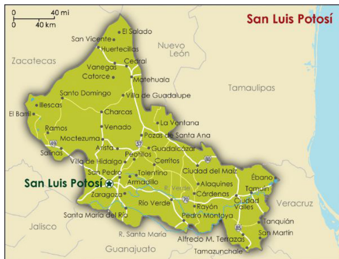
Map of the San Luis Potosi area