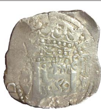
PERU - 1659 cob LIMA PHILIP IV "STAR OF LIMA" 8 REALES VF, KM#18.1 SKU# 50681

A wholesome example, not sea salvage and choice VF for the type, thus most desirable. Full weight at 26.9 grams.