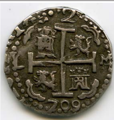
PERU - 1709/8-M cob LIMA PHILIP V ROYAL 2 REALES XF, KMR#32 SKU# 50425

4 See for example Jose Toribio Medina: "Las Monedas Obsidionales Hispanoamericanas" (1919), pp. 121 and 137.