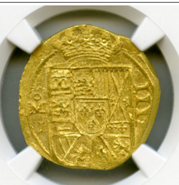
MEXICO - 1714 Mo J 4 ESCUDOS NGC MS64, KM-PN#055.2 SKU# 26461

Undated, but identifiable as to date by the smaller crown unique to 1714. Boldly struck with full cross and nearly full shield, Highest NGC grade (May 2014).